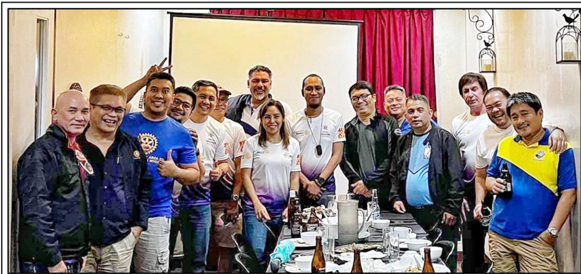
PUBLIC IMAGE WEEK PLANNING AND PREPARATION WITH AREA 3D ACOM PRESIDENT-ELECT AND SECRETARY-ELECT THE DIFFERENT AREA 3D ROTARY CLUBS.